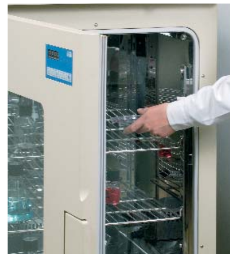
Optimum temperature homogenization can be achieved with an even load distribution of up to 70% unit volume.